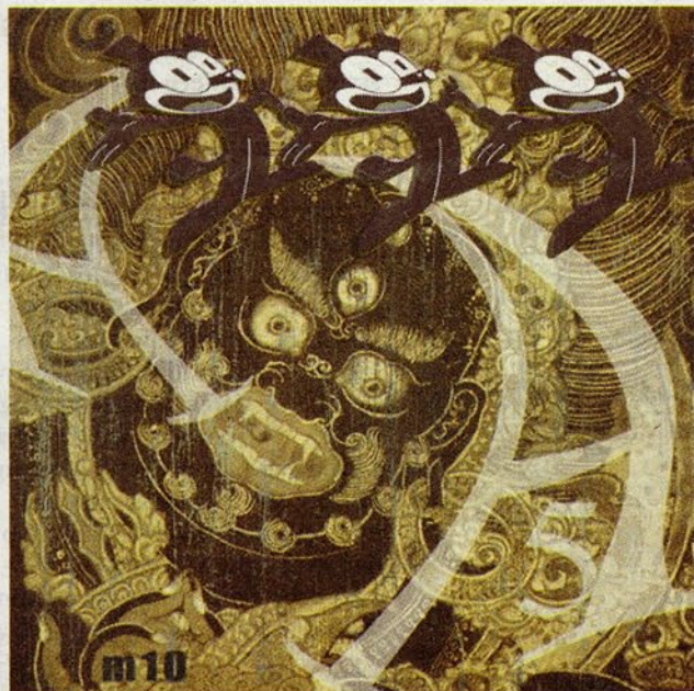
'A5-NUDE 11,' METROV