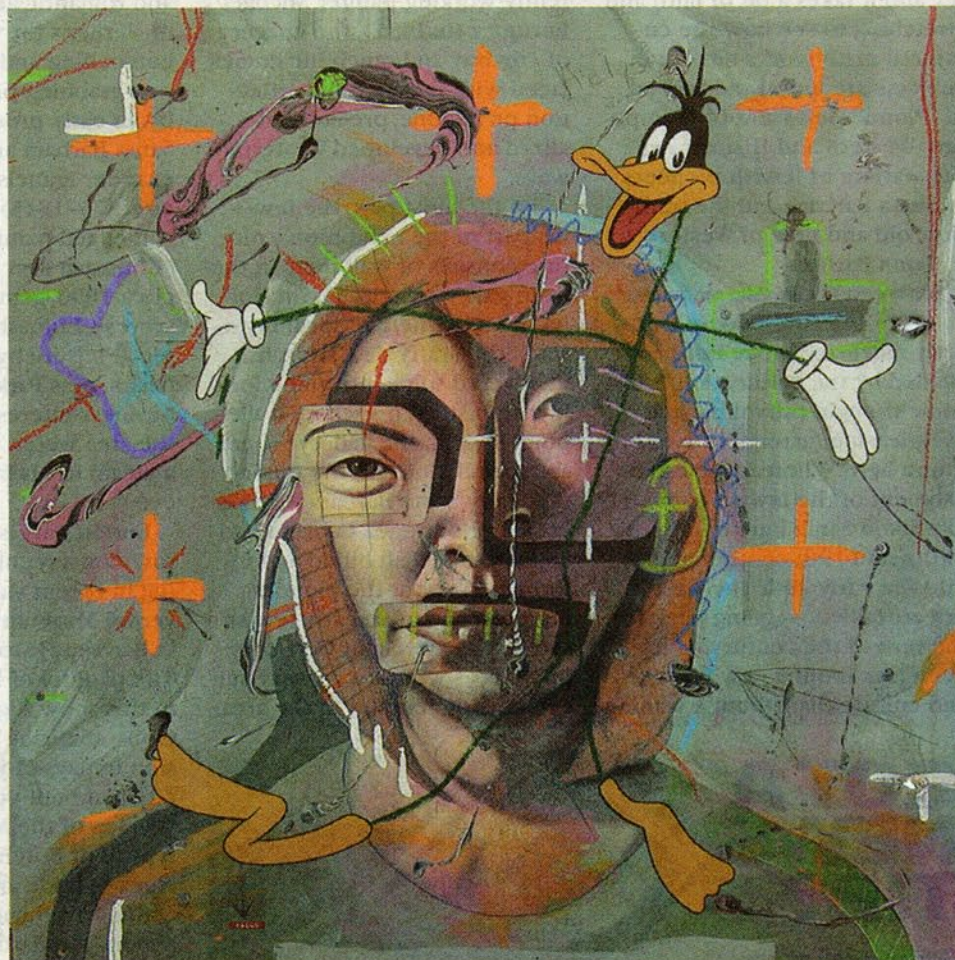
'OKADA SAN 8.35A,' METROV

All in all, Blodgett approaches the business of photography in a relatively straight, classic way, but then pushes outward in her re-imagining phase. Likewise, artistic norms are pushed around in a friendly and accessible way.